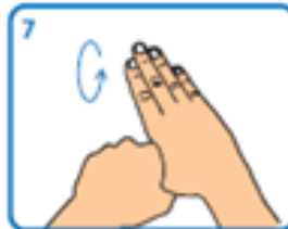
7 Rub each thumb clasped in opposite hand using a rotational movement