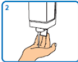
2 Apply enough soap to cover all hand surfaces