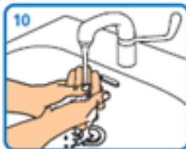
10 Rinse hands with water