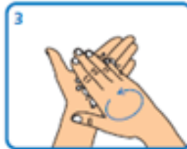
3 Rub hands palm to palm